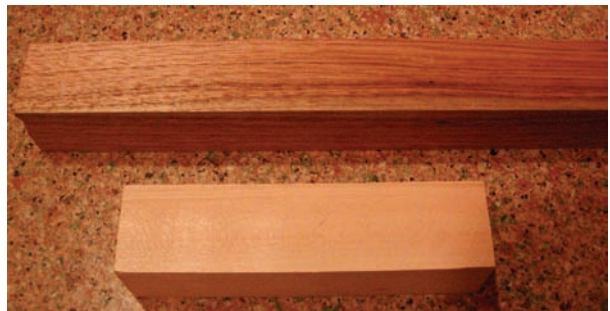
Butternut and Basswood blocks for sale

will take place at the December Christmas party (need not be present to win). We are also selling wood. 1.5" X 1.5" X 6" basswood blocks for $2, and 1.5" X 1.5" X 12" butternut blocks for $5. All proceeds will be sent in a Christmas card to Wanda.