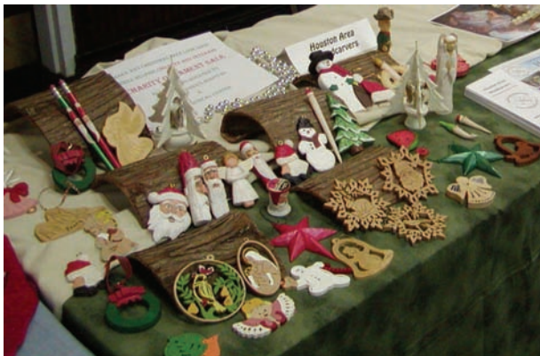
Ornaments for sale at the Texas Woodcarvers Guild show in Kerrville

Heartfelt thanks to everyone who has contributed ornaments. If anyone has more, please bring them in. If you have some unfinished ornaments and you would like some help finishing them, please bring them to a meeting. Bring ornaments to the October and November meetings. The more the better.