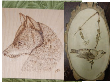
Woodburning dog and bird projects.