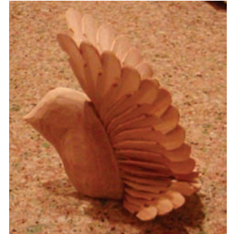
The fan carved bird is back.