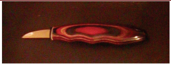
Win this Helvie knife

On her behalf the club is raffling off a Helvie carving knife ($40 dollar value). The tickets are $1 each or 6 for $5. The drawing