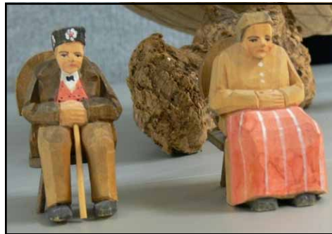
Mike Moeskau showed various purchased carvings: antique carvings of human figures for $2 each, the bear from a Livingston antique shop for $2, and a turtle with a broken flipper (he glued it back) for $10.