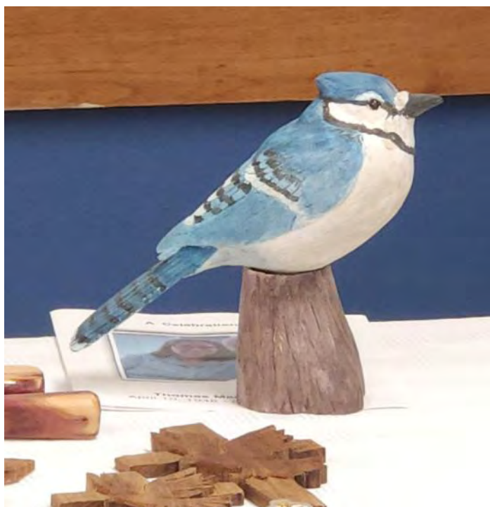
One of Tom Warren's Last Carvings