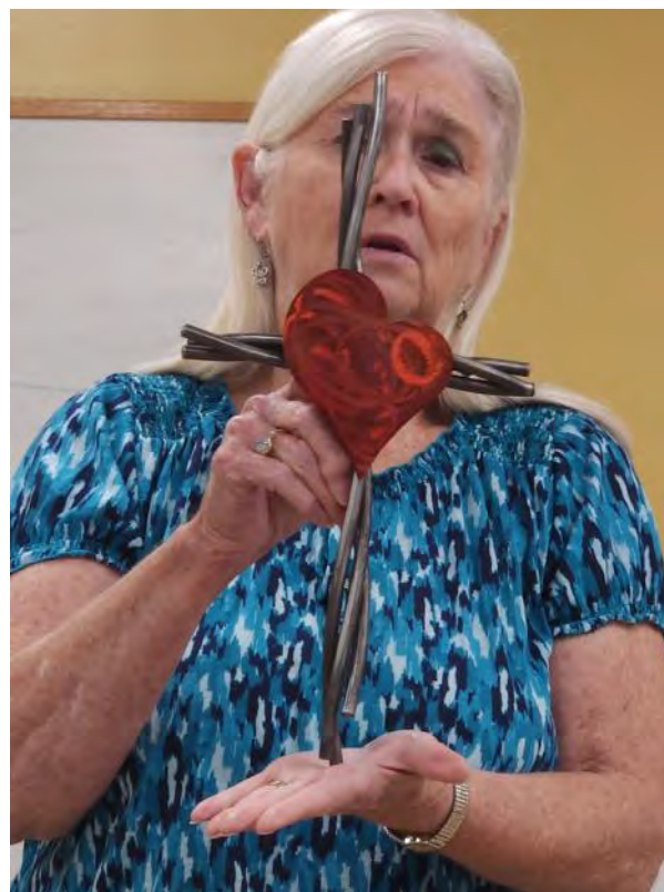
Metal Cross, artist unknown