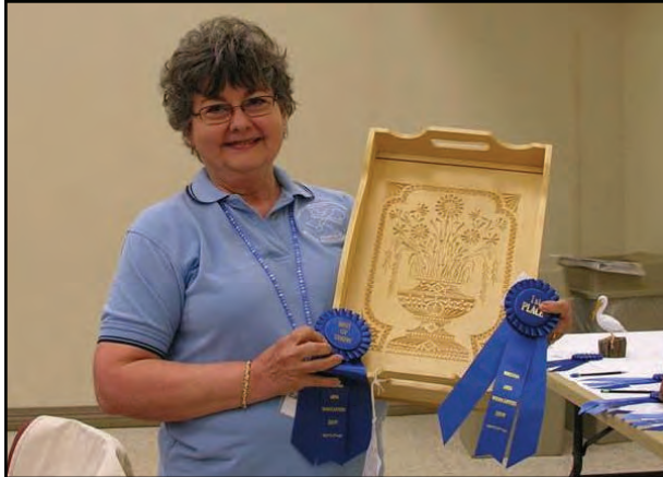
Best of Show, Vase of Flowers by Carolyn Halbrook, 801