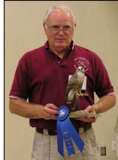
People's Choice, Rough-Legged Hawk by Butch Wilken, 602

Note: see last page for more photos of best of show and people's choice carvings.