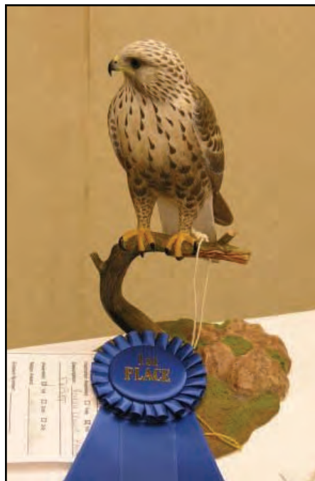
People's Choice by Butch Wilken