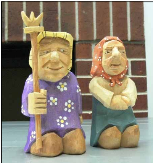
Glenn Miller carved this Troll Queen with the yellow scarf from a Wood Carving Illustrated article. It is flat plane style. The red scarf figure was from the Whittling Little People book.