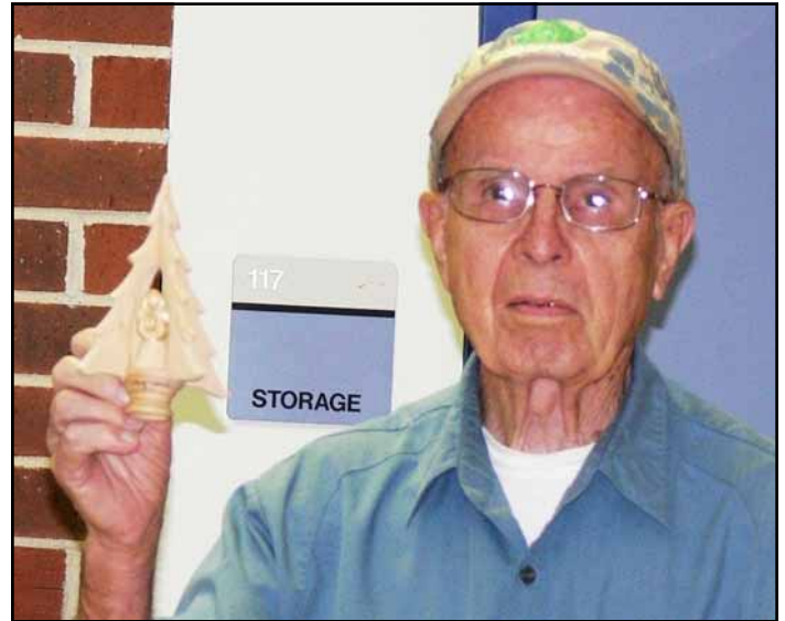
Bob Lyons carved the tree from a project in Chip Chats.